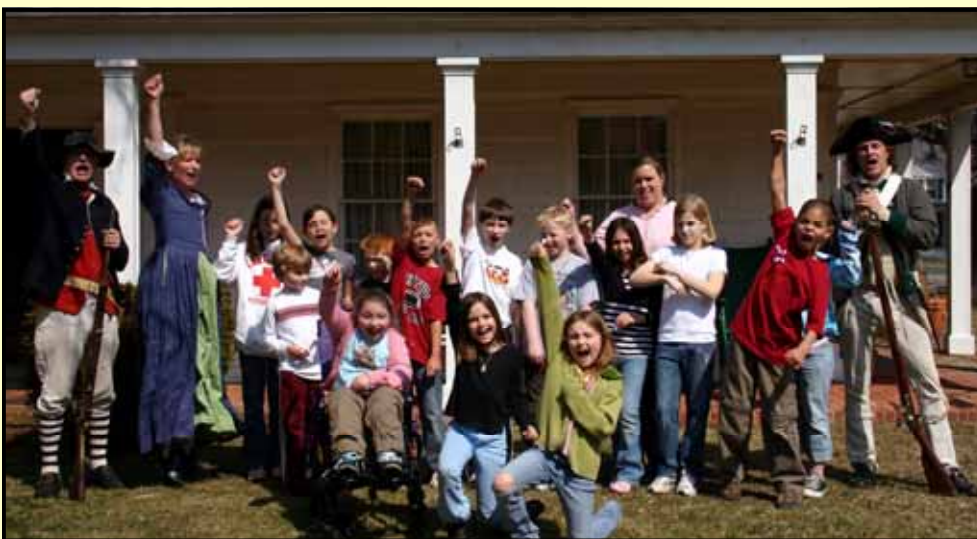
A Shelter Island 4th grade class gives a big huzzah! after a visit back to the 18th century.

The most important consideration must be how an organization, museum, historic house, or other history site can best serve the community, how it incorporates the community into its thinking, planning and programming. The answer is